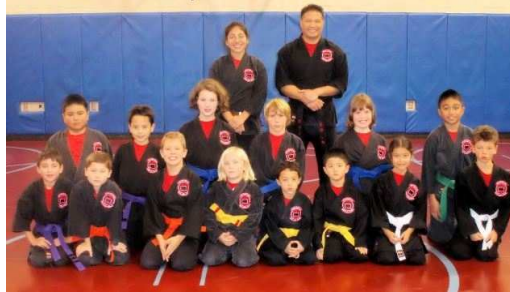
Bothell Kempo-Karate School 2006

We can never stress enough on how to protect our children from life’s dangers. In our junior warrior class, we teach more than just kicking and punching. Students learn the fundamentals of Violence Diffusion, Stranger Danger, Safety Awareness and Crime Prevention by our certified instructors.